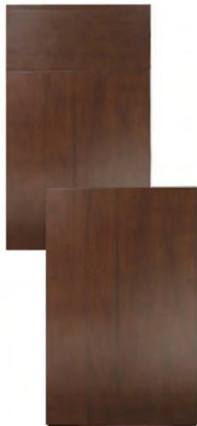
Bass Cinnamon Flat