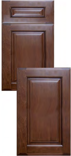
Bass Cinnamon Raised